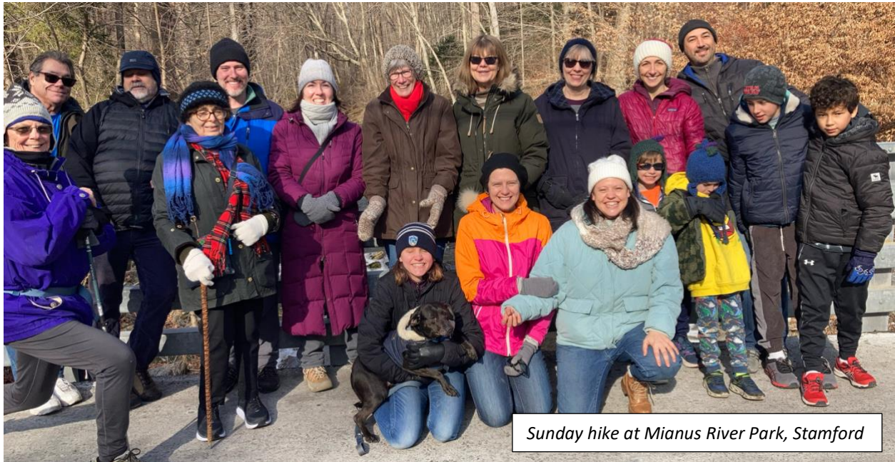
Sunday hike at Mianus River Park, Stamford

UU theology and history, and spiritual practice workshops in mandala-making and mindful photography. Social events such as hikes at Mianus River Park and coffee shop conversations, and a new UU Social Souls google group have helped people to form new connections.