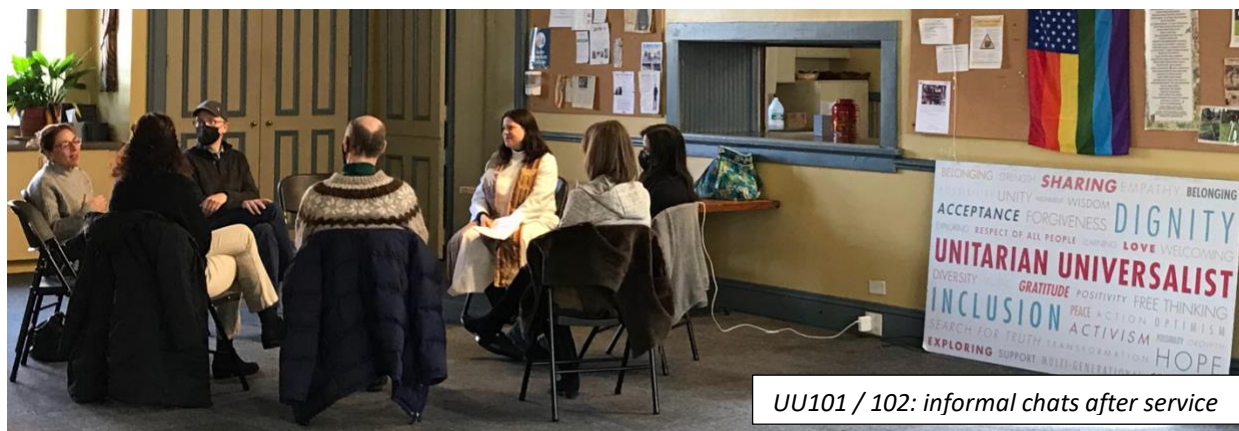
UU101 / 102: informal chats after service