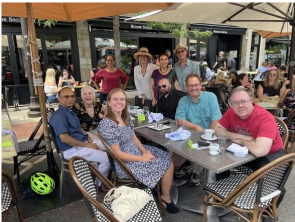
Social Souls at the Second Sunday Brunch