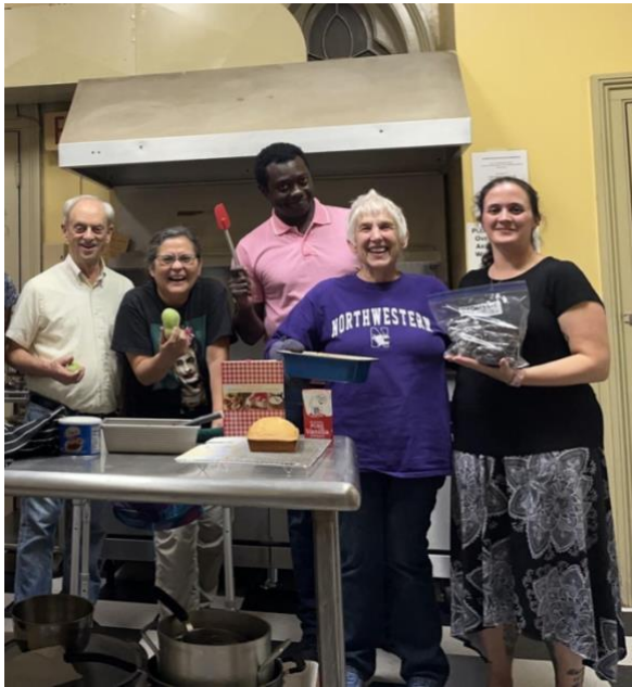
Baking and Bonding