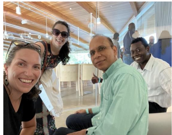
Grace Farms Latin Jazz Concert