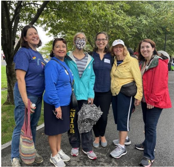
Interfaith Walk for Unity

What a joyous start to a new congregational year! 61 people joined us in person and on Zoom for our Ingathering Service on September 11th. I am glad to greet so many new faces in our sanctuary, and to welcome back the very familiar ones too.