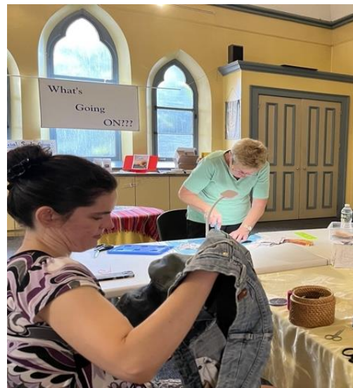
Fiber Arts Group